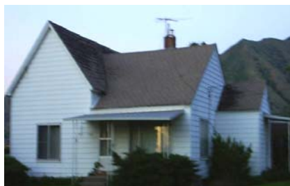
The Louise Jensen Thompson Vernon Ray Bird Home 1183 South Main Street Mapleton, Utah

The Mapleton City Newsletter can be viewed at our website up to three days prior to receiving it in the mail at www.mapleton.org .