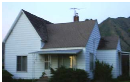
The Louise Jensen Thompson Vernon Ray Bird Home 1183 South Main Street Mapleton, Utah

The Mapleton City Newsletter can be viewed at our website up to three days prior to receiving it in the mail at www.mapleton.org .