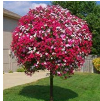
"Flower" Tree Planter - $300