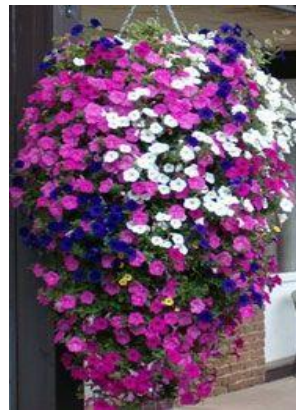
12" Hanging Basket $75

More information is available at the City Office or at mapleton.org/parksandrecreation.html . We encourage all citizens to get involved in this wonderful program, and make Mapleton an even more remarkable city!